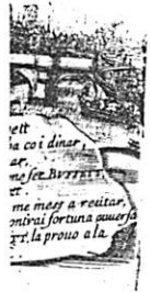
le of 'Mezzetino'.