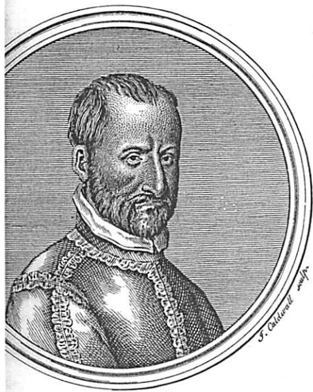
Giovanni Pierluigi da Palestrina