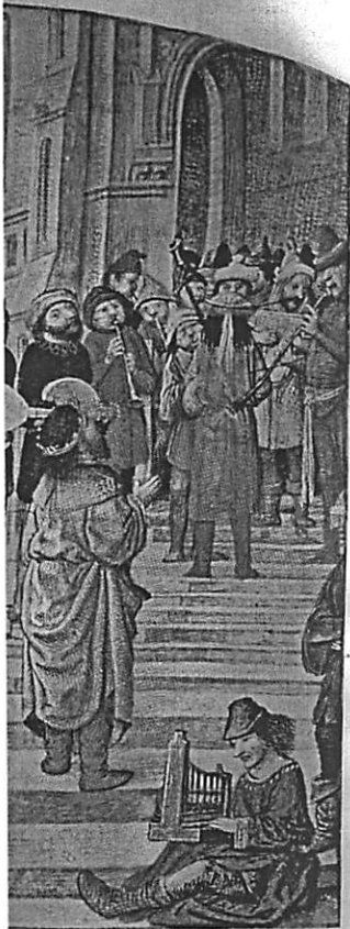
LATER FIFTEENTH CENTURY (?) and tabor, triangle, shawm (?), buzine, soft shawm; the seated figure in the right from which this picture is taken is Spanish, Flemish artists 1, fo. 184v)

EDITED BY DOM ANSELM HUGHES AND GERALD ABRAHAM